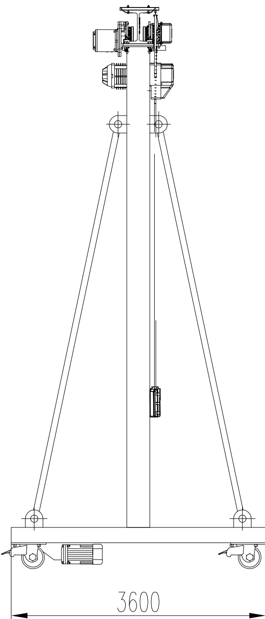
Hoist Technical parameters